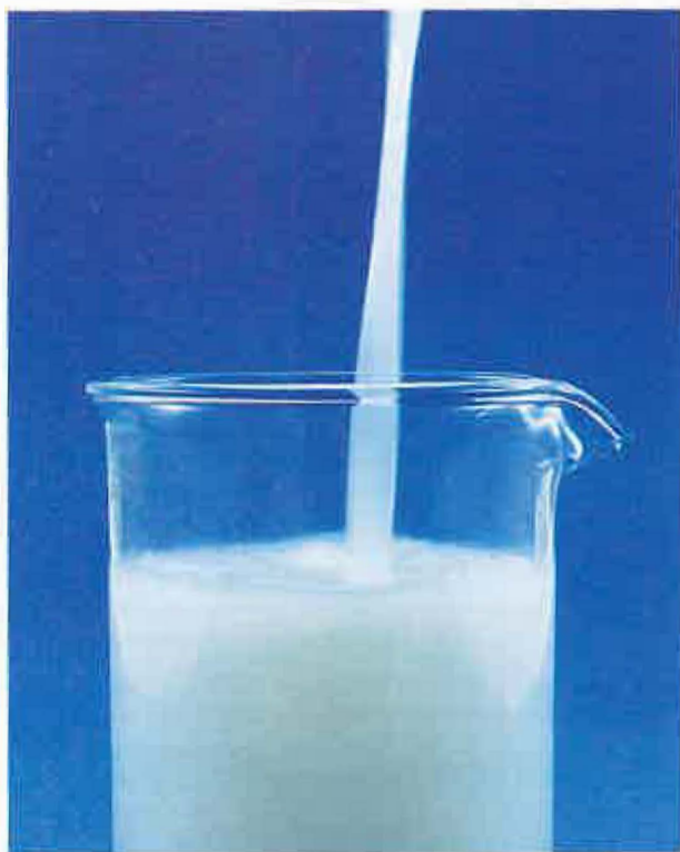
New CONDAT VICAFIL SL wet drawing lubricant.

With worldwide recognition for its wire drawing dry lubricant range, CONDAT is always seeking to improve its lubricants, whether to increase its customers' productivity or to optimize sustainability of its products. At wire 2018 , the company will present its brand-new range of soluble oils that have been reformulated to meet the latest wet drawing requirements.